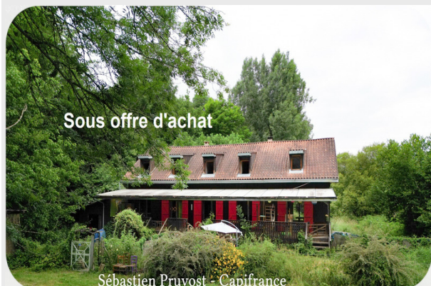
Sébastien Pruvost - Capifrance