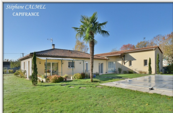
Stéphane CALMEL CAPIFRANCE